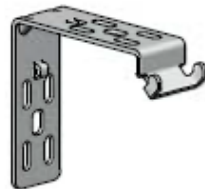
FRS Centre Support Bracket (Face Fit) Available in 100mm and 120mm